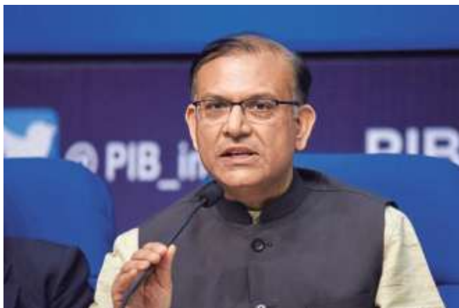
Minister of state for civil aviation Jayant Sinha.

Minister of state for civil aviation Jayant Sinha says the economy is ‘going through a paradigm shift’ and that there is a lot of innovation happening